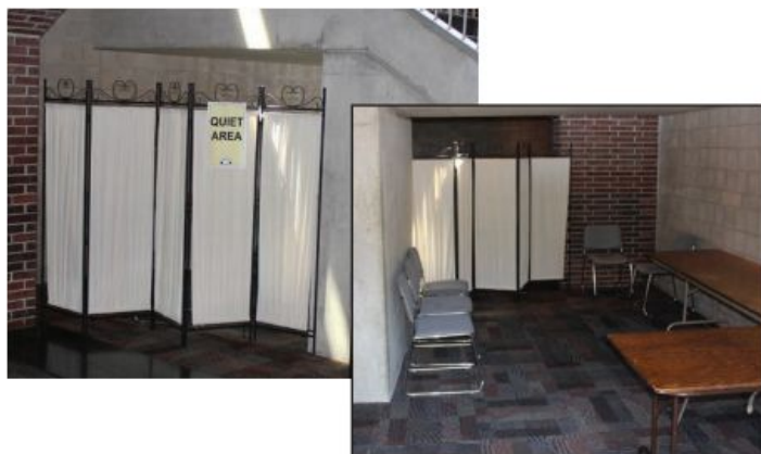
A "Quiet Area" is curtained off on the west side of the lobby.