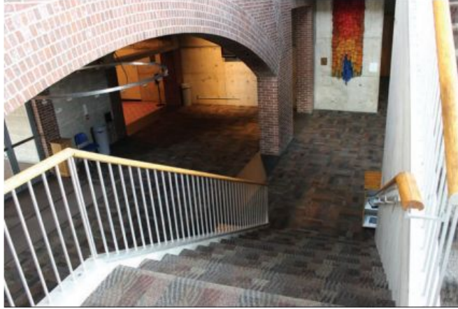
There are a lot of steps in the Arts United Center.