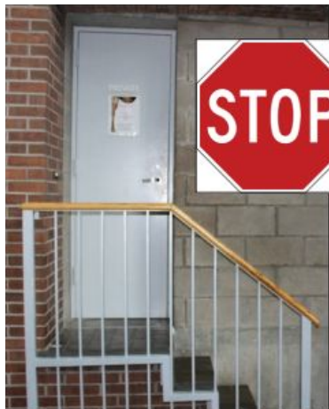
Restricted Areas will be clearly marked with STOP signs.