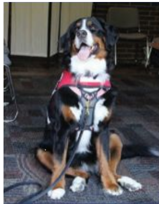
A trained therapy dog is on site during the performance.