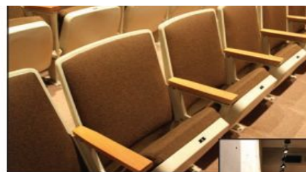
Inside the theatre Seating