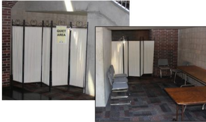
A "Quiet Area" is curtained off on the west side of the lobby.